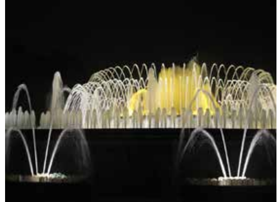
TOP: Each stream of water in the fountain is shot up from below. The force of gravity pulls the water down, forming an arc shape.

Force, motion, gravity, mass, and inertia...these concepts and more govern the world (and our Universe). They are complex ideas but once you understand them, you will see everything a little more clearly.